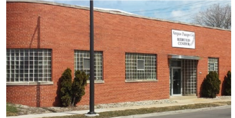
Pump Remanufacturing Center – Milwaukee, Wisconsin

The designs of competing pumps have not changed in decades. When material upgrades aren't sufficient, we innovate: The patented ZP3 and patented ZP1+; AC+ centrifugal pumps; LH close-coupled, and high pressure centrifugal pumps are all examples of the Ampco Advantage. We invite you to see for yourself why Ampco Pumps Company is truly the best sanitary pump manufacturer in the world.