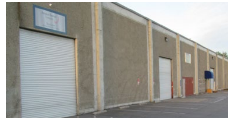
Pump Remanufacturing Center – Stockton, California