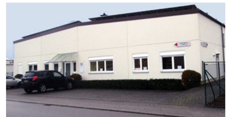
Ampco GmbH offices, warehouse, and assembly facility