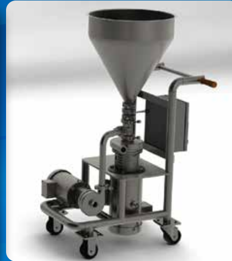
MODEL AC+2116 SYSTEM

Powder addition rate: up to 50 lbs. per minute (23kg/min) Normal liquid flow rate: 40 GPM (9.1 m 3 /hr) Powder addition inlet: 2 inch Liquid inlet: 1-1/2 inch (at feed pump) Liquid outlet: 1-1/2 inch Clamp connection standard Close coupled to a 5HP, 3600 RPM motor Shipped complete with supply pump, control panel and cart