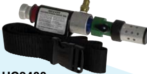
HC2400 Hot/Cold Tube Compressed Air Warming or Cooling. Used with GenVX, 88VX, CC20, RT, and GR50 Series Respirators