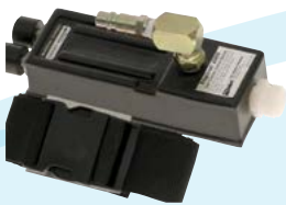
Frigitron 2000 Cool Tube Used with select Bullard Free-Air® Pumps and the ICE Pump