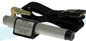
AC1000 Cool Tube Used with GenVX®, 88VX, CC20, RT, SparxLift, and GR50 Series Respira- tors