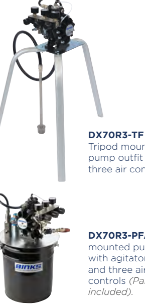
DX70R3-TF Tripod mounted pump outfit with three air controls.