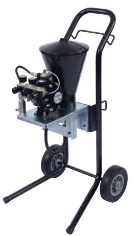
DX70R3-CFG Cart mounted pump with 1.4 gal (6L) gravity bucket feed filter and three air controls.