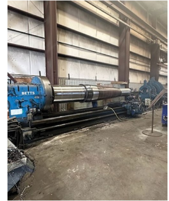
Horizontal lathe machining a crusher main shaft