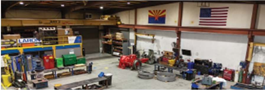
165,000 Square Foot Facility