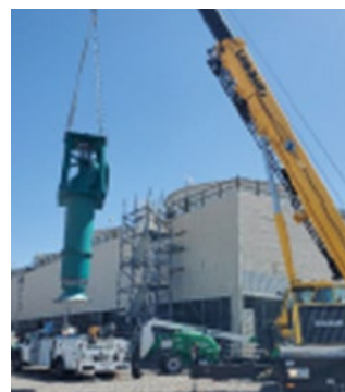
Circ Water Pump Replacement