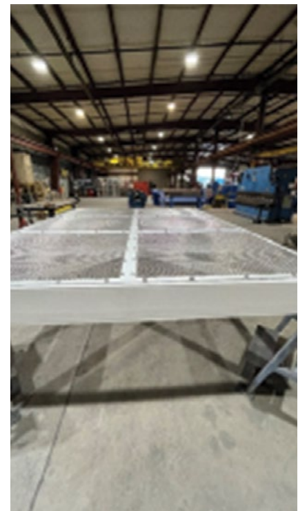
Trash Screen Fabrication