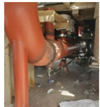
Main Steam Header Replacement